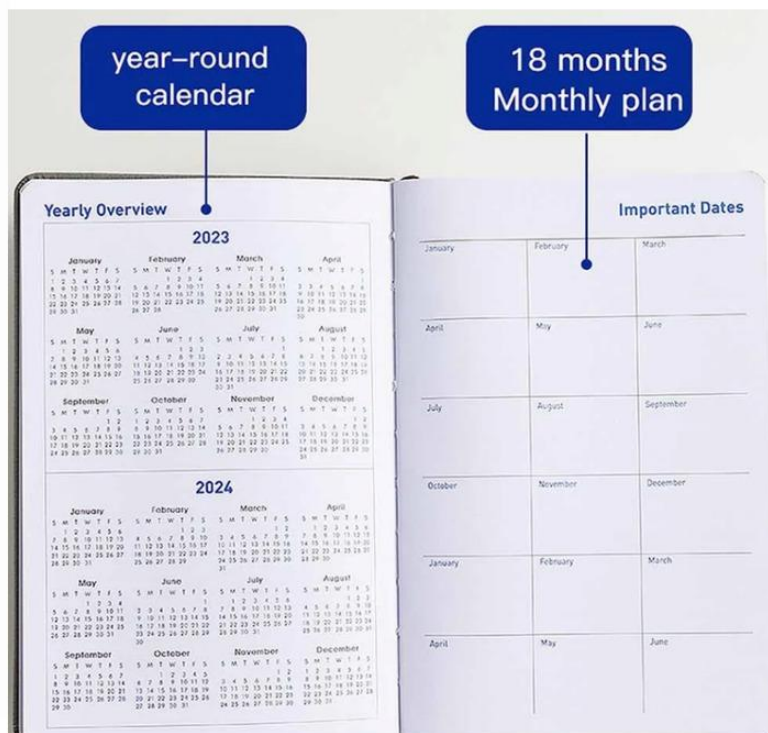
Sample Image of Diary