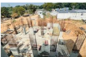
Construction of CoEN Building

As a part of CoEN, AATMA (Acceleration Aspirational Block Monitoring Approach) initiative was introduced to enhance data accuracy and skill development for Anganwadi workers and MS in Sayla, Santalpur, and Tharad blocks and it involved cross-verifying health data for 5,470 children, revealing discrepancies in height and weight measurements. The initiative's success led to further expansion with "Mission June" and an upcoming "Mission Zone."